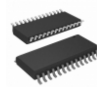
AT27LV256A-90RU Micrel / Microchip Technology IC OTP 256KBIT 90NS 28SOIC