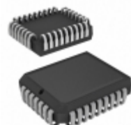
AT27LV512A-12JI Micrel / Microchip Technology IC OTP 512KBIT 120NS 32PLCC