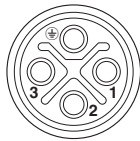
Pin assignment of M12 socket, 4-pos., S-coded, socket side view