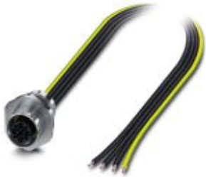
Flush-type connector, Power, 4-position, Socket, Link: M12, S power, Front mounting, M16 x 1.5, Individual wires, Cable length: 0.5 m

Please be informed that the data shown in this PDF Document is generated from our Online Catalog. Please find the complete data in the user's documentation. Our General Terms of Use for Downloads are valid ( http://phoenixcontact.com/download )